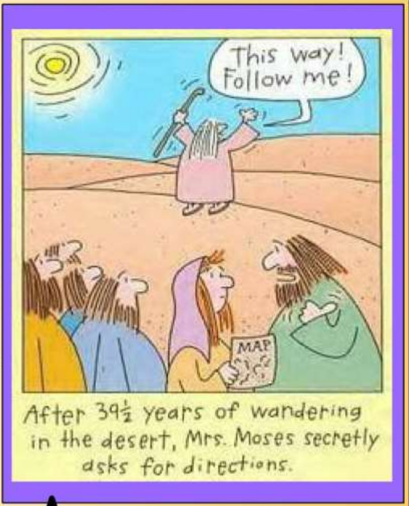
After 39½ years of wandering in the desert, Mrs. Moses secretly asks for directions.