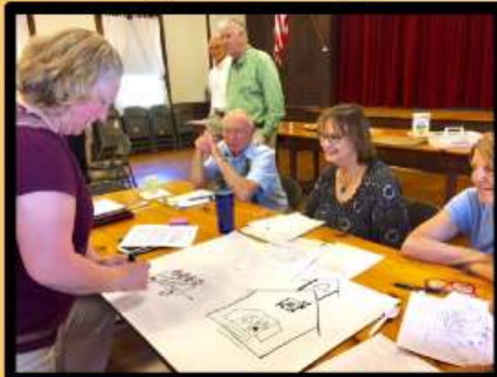
July 9 meeting