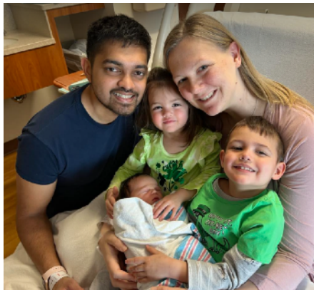
The Peiris Family