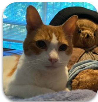
Phantom, Odd man out!