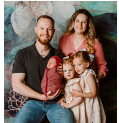
The Shelnutt Family