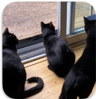
Hocus, Pocus, and Merlin watching outdoor birds.

As many of you know, our household is very busy with cats and dogs (Shelties in particular!). We will be adopting another Sheltie from Maine Sheltie Rescue and will report on her in the next WCC newsletter.