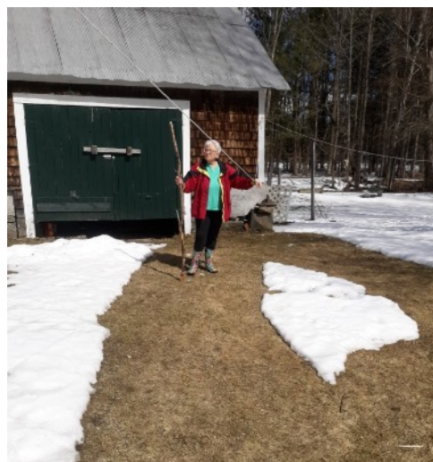
Jean Struck sets new record trekking across Maine in 7 seconds! (Check out the shape of the snow