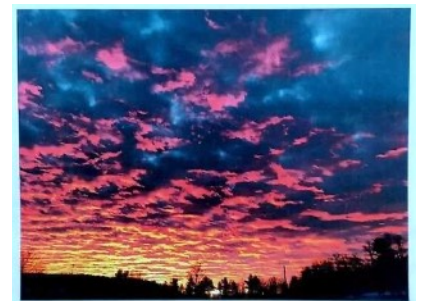
6:30 am Sunrise Service at Keoka Beach

Easter Sunrise Service was shared with the Harrison and North