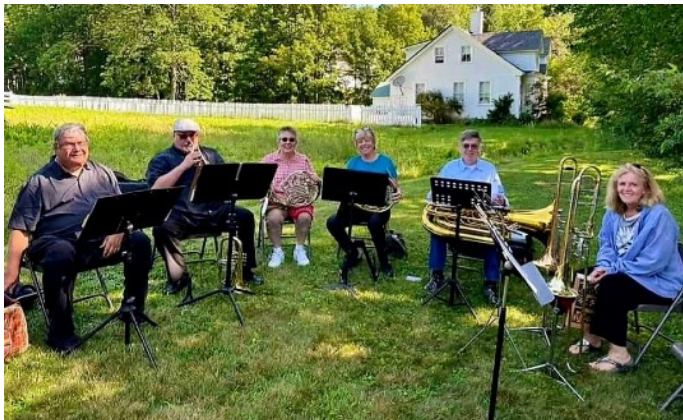
The Friday Night Brass

As of July 9 th the deacons no longer are collecting offerings during Sunday's services. There are collection plates at the back of the sanctuary to leave offerings either before or after the service.