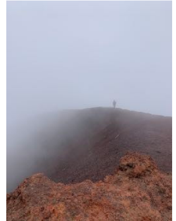
Right: Our only cloudy day of the trip was on the active volcano, Mt. Etna. The small figure is Martha who was hiking a more strenuous trail than I. The poem she wrote about Mt. Etna is below. Luckily, the volcano did not erupt until about 2 weeks later when we were safely home! And it was dramatic, but mostly steam, not lava. No one was burned!