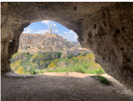
Above: View of Matera, Italy from a Paleolithic cave where humans lived as far back as the Paleolithic era. Our hotel in Matera was built inside several such caves.