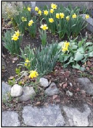
A gaggle of daffodils!