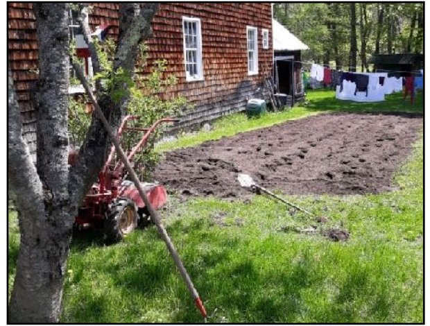
A sure sign of spring is preparing the ground.