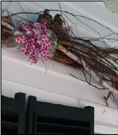
Mourning dove chicks nesting on our roof.