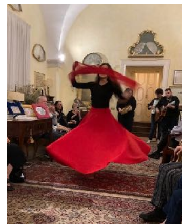
Right: And there was dinner, music and dancing in Lecce!