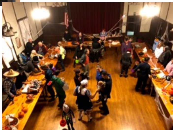
Right: Library members and church members handed out treats to the many little goblins, ghosts, and skeletons...