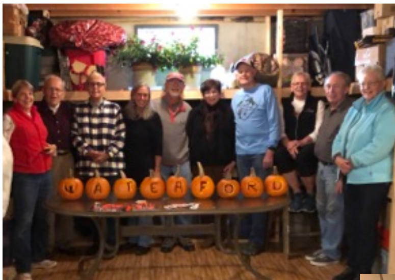
Left: Church members carved pumpkins in preparation for the community event

by the church and the library. It was simply moved inside to a transformed Wilkins House. And...a good time was had by all!