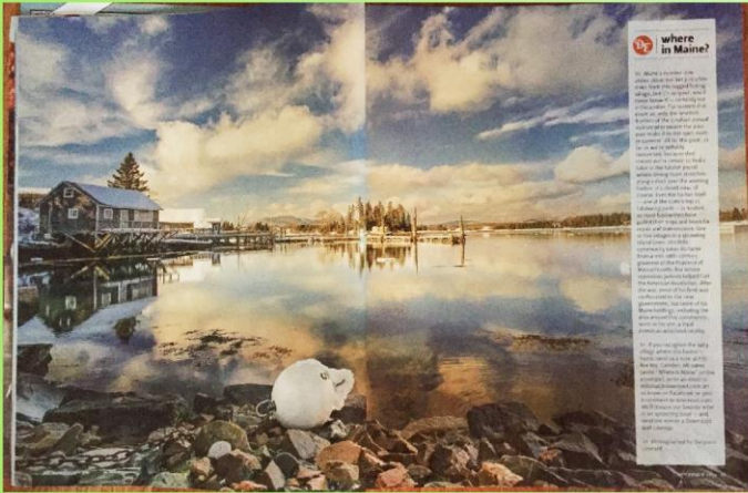
Down East magazine

A photo by Darylann Leonard is again featured in the "Where in Maine" section of December's Down East Magazine. She also had a photo chosen for one of their 2017 calendars. --Nancy Engdahl